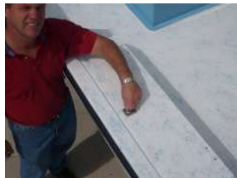
Each of our 21 comes with two lockable storage compartments that connect with the front deck.