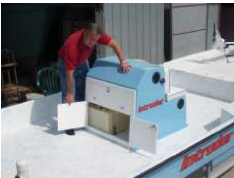
The bottom of the console stores a 27 gallon fuel tank. It is well vented.