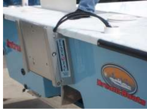
All of our boats use a Bob's Machine Shop jack plate.