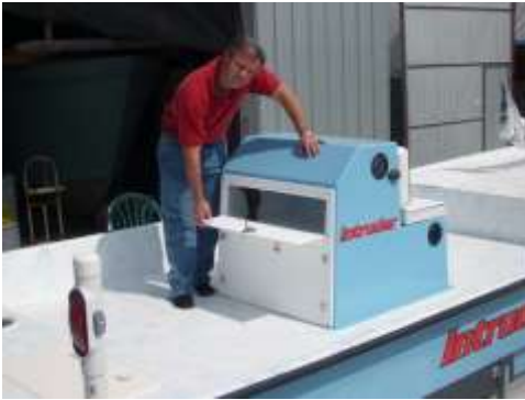
The console has three doors.