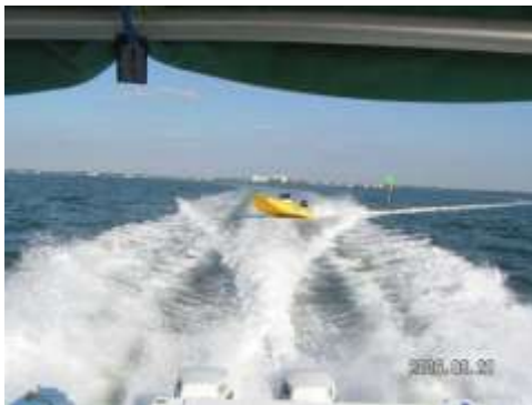
Looking for waves