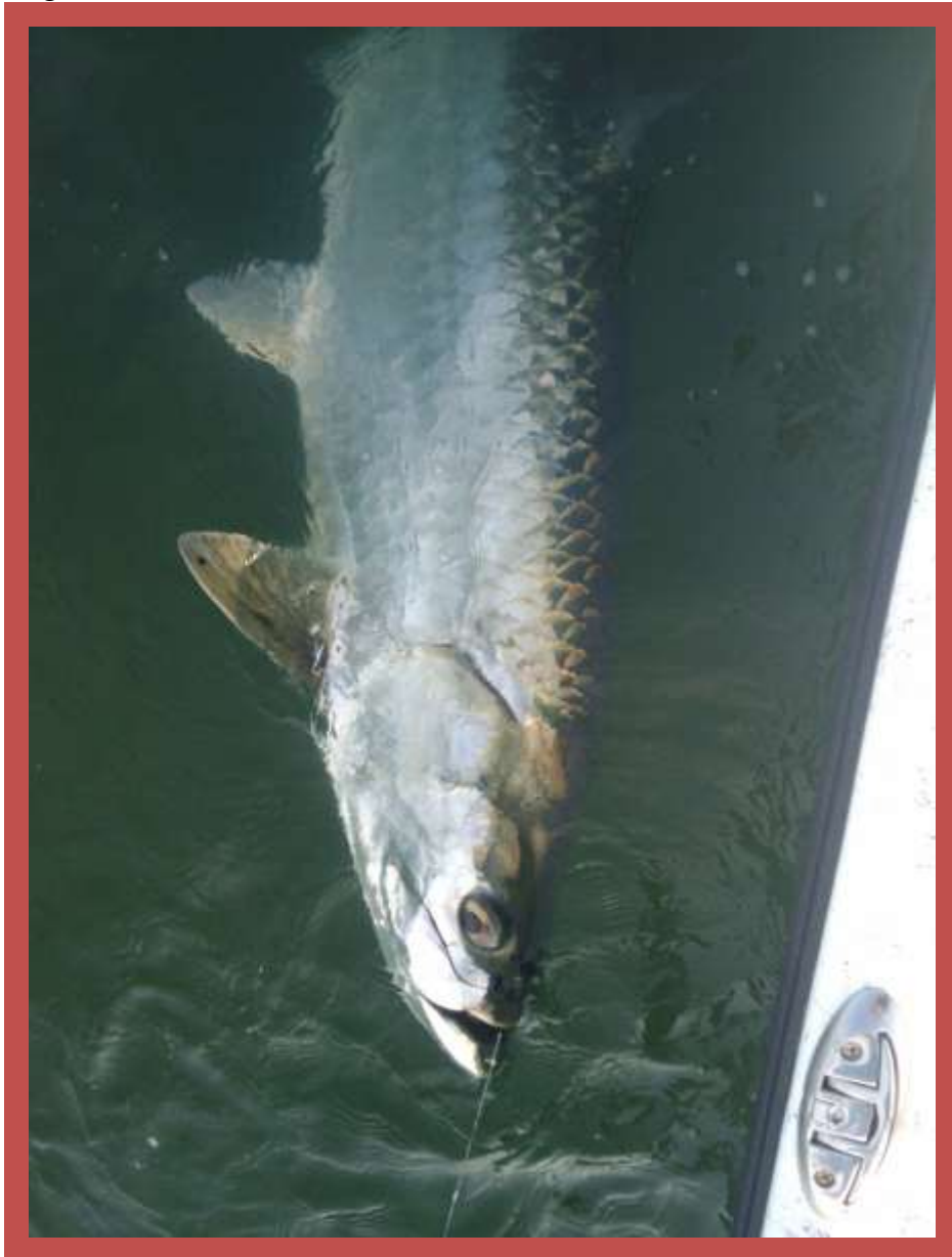
We use high quality SS fold up cleats.