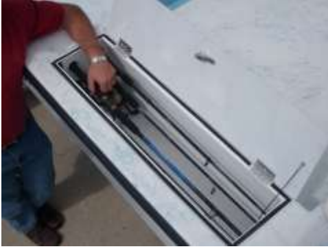
These storage lockers can fit four 8'4" rods.