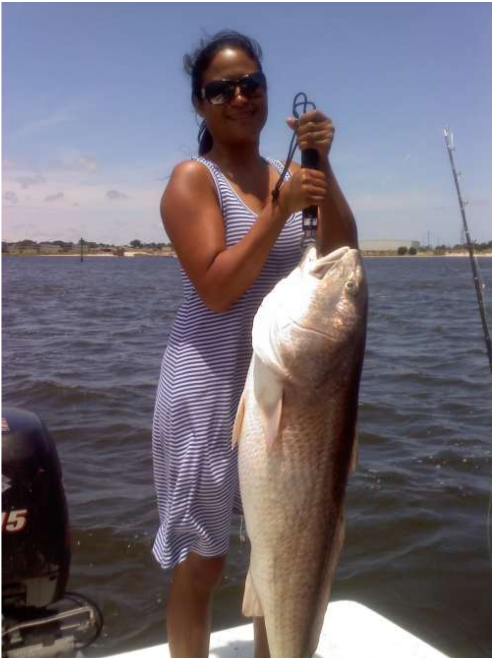
The rear deck is also a very stable platform.