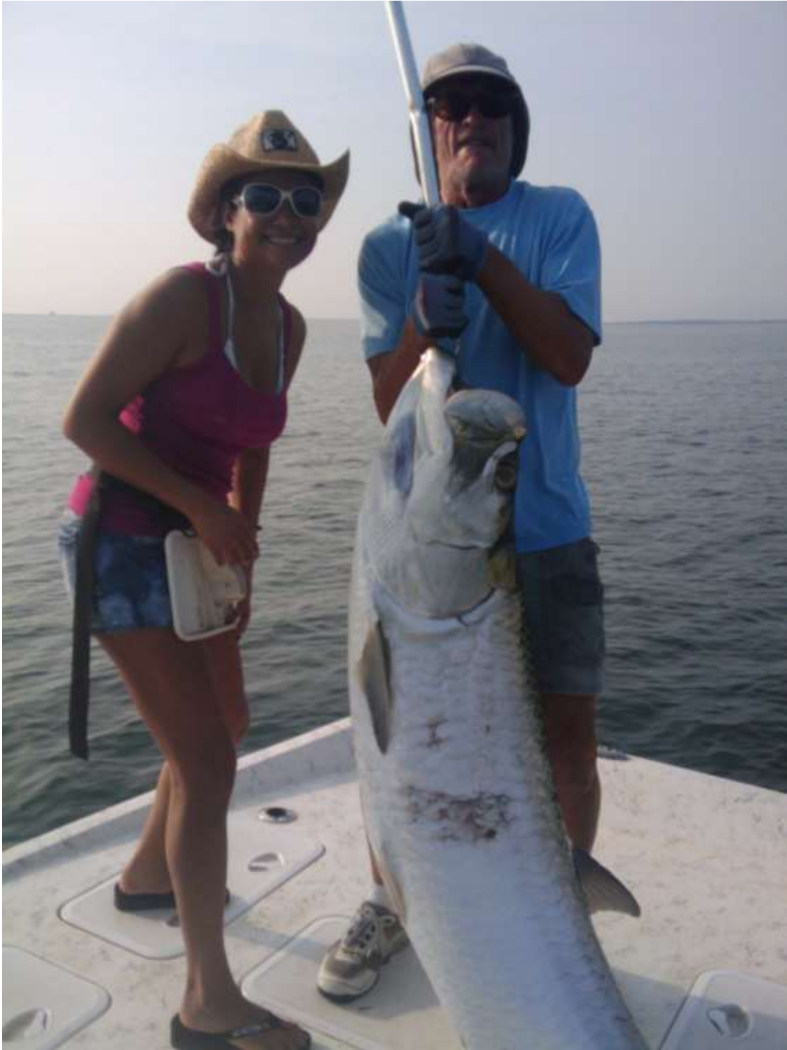
The incredible stability of the Intruder 21 makes most users very comfortable..