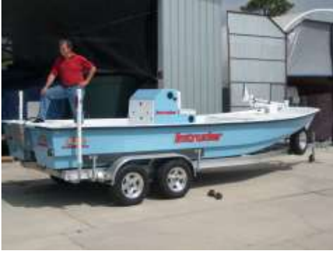
This is our 21 with Ralph.